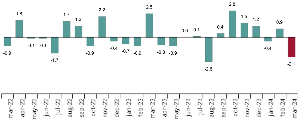
General index of the turnover for the Market Services Sector. Seasonally and calendar adjusted Monthly rate. Percentage

After adjusting for seasonal and calendar effects, the monthly variation of the general index of turnover for the Market Services Sector between March and February was -2.1%. This rate was three points lower than that observed in February.