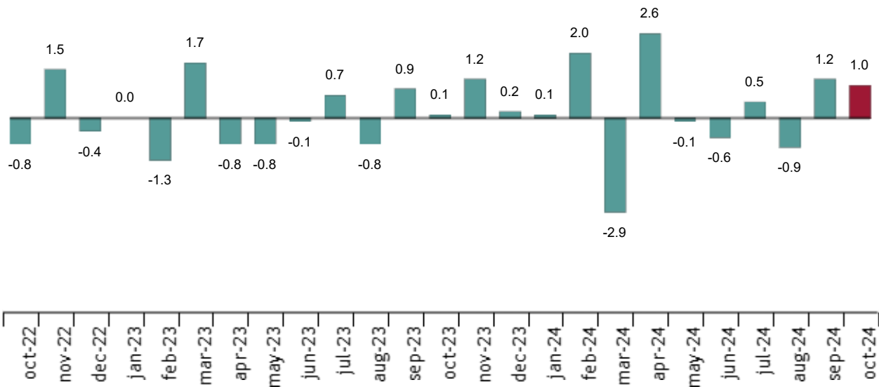
General index of the turnover for the Market Services Sector. Seasonally and calendar adjusted Monthly rate. Percentage

After adjusting for seasonal and calendar effects, the monthly variation of the general index of turnover for the Market Services Sector between October and September was 1.0%. This rate was two tenths lower than that observed in September.